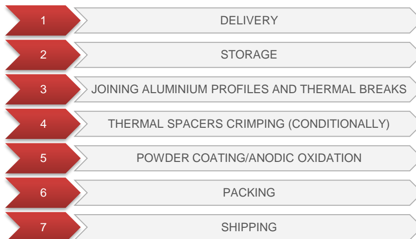
Fig. 3. A scheme of manufacturing of facade systems by Aluprof S.A. in factory in Bielsko-Biala (Poland)

The production process at the plant in Bielsko-Biala begins with the delivery of aluminum profiles produced in the press. Then, after unpacking, the profiles are joined together with the thermal break in special profiles joining machines. Subsequently, the thermal separators are crimped, but not in every case. After joining and crimping, profiles can be found in one of the two paint shops - vertical or horizontal, where they are subjected to the painting process. After drying, they are packed and then transported to the customer.