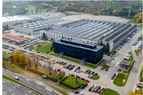
Fig. 1. A view of the Aluprof S.A. production hall in Bielsko-Biała.

Aluprof S.A. sells its solutions to most European countries and to the USA. The company has representative offices and distribution centres across Europe: in Germany, Great Britain, Ukraine, the Czech Republic, Hungary, Romania, Denmark and also in the USA.