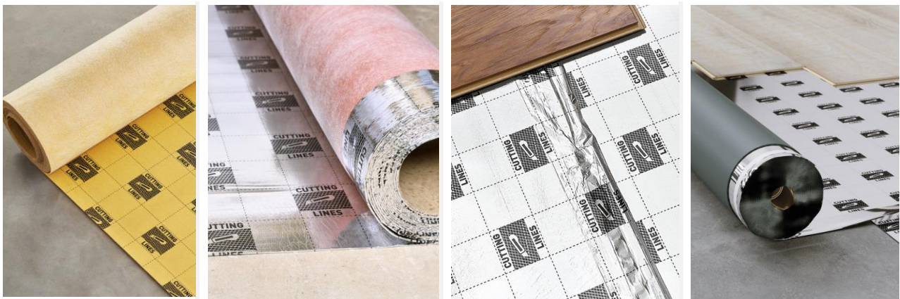
Thickness: 1,1 mm

This environmental declaration type III covers products from the polyurethane-mineral (PUM) underlays group. The products are made of polyurethane foam with a mineral filling and laminated with PET. The underlay for floor panels is an important element of the new floor, which significantly affects its durability, improves the acoustic comfort by high level of noise reduction. Products (figure 1) are intended to be used for rooms with high traffic intensity and provide heavy load resistance. The products are manufactured in three basic thicknesses from 1.1 to 3.0 mm. The basic products are 1,1mm, 1,5mm, 2,0mm and 3,0mm. All products have a set of tests in accordance with the EN 16354 standard.