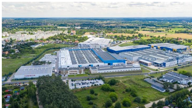
Figure 1 The view of Ceramika Tubądzin II Sp. z o.o.. manufacturing plant located in Ozorków.

GRUPA TUBĄDZIN has been setting design trends for 40 years, and the company's products are characterized by global quality, thanks to the use of the most advanced technologies. The manufacturing plant of Ceramika Tubądzin II Sp. z o.o. is located in Ozorków (Poland), where it produces dry-pressed tiles up to 120 x 60 cm. Tubądzin brand tiles are made from natural and noble raw materials, and dyes that are safe for health and nature are used to decorate them. They can be used in any space, not only in bathrooms - they are perfect as an original and durable cladding for furniture. The rich assortment of the Tubądzin Group consists of recognizable brands, each of which introduces its own collections and product lines. Trading partners are an extremely important element of the Tubądzin Group's operations. The distribution network is based on a group of large ceramic tile wholesalers, which serve smaller retail outlets in their area of operation. The combination of distributors' involvement in the promotion of products allows the company to steadily increase sales. Currently, the Tubądzin Group sells its products in 70 countries. Sales countries - 70, showrooms in the country - 1500, showrooms abroad - 2000, annual production in m 2 - 15 million, export sales - 35%.