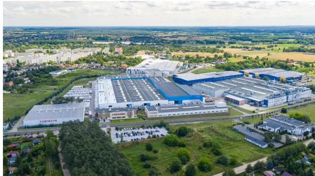
Figure 1 The view of Ceramika Tubądzin II Sp. z o.o.. manufacturing plant located in Ozorków.

GRUPA TUBĄDZIN has been setting design trends for 40 years, and the company's products are characterized by global quality, thanks to the use of the most advanced technologies. The manufacturing plant of Ceramika Tubądzin II Sp. z o.o. is located in Ozorków (Poland), where it produces dry-pressed tiles up to 120 x 60 cm. Tubądzin brand tiles are made from natural and noble raw materials, and dyes that are safe for health and nature are used to decorate them. They can be used in any space, not only in bathrooms - they are perfect as an original and durable cladding for furniture. The rich assortment of the Tubądzin Group consists of recognizable brands, each of which introduces its own collections and product lines. Trading partners are an extremely important element of the Tubądzin Group's operations. The distribution network is based on a group of large ceramic tile wholesalers, which serve smaller retail outlets in their area of operation. The combination of distributors' involvement in the promotion of products allows the company to steadily increase sales. Currently, the Tubądzin Group sells its products in 70 countries. Sales countries - 70, showrooms in the country - 1500, showrooms abroad - 2000, annual production in m 2 - 15 million, export sales - 35%.