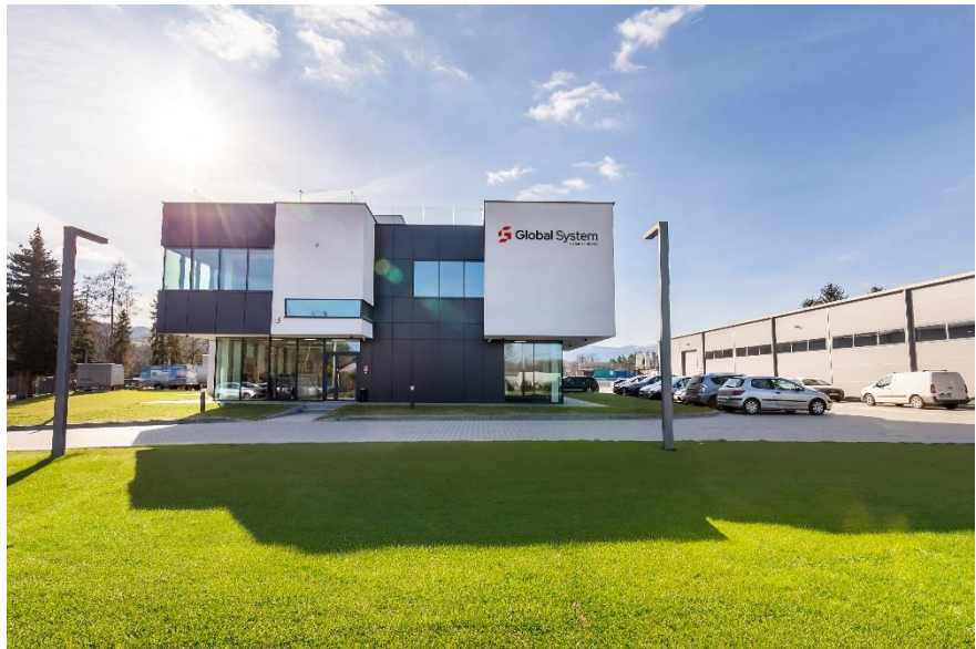
Figure 1 The view of GLOBAL SYSTEM Sp. z o.o. manufacturing plant

GLOBAL SYSTEM is a manufacturer of fire curtains and loading systems with a manufacturing plant located in Podegrodzie (Poland). The core products offered by the company are: fire rated rolling curtains, horizontal sliding fire doors, vertical fire doors. The company also offers movable and fixed smoke curtains. Apart from fire rated solutions, company produces loading systems with a full range of accessories used in loading technology for industry,