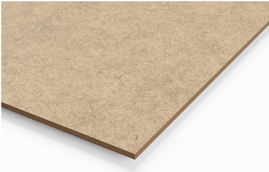
Fig. 2. High-density fibreboard produced by Woodeco.

High-density fibreboard manufactured on the basis of wood fibres, bonded with synthetic resins and other additives. The product is available in many formats and thicknesses in the range of 1.5 - 5.2 mm. The surface of HDF boards can be additionally sanded and refined by varnishing, wrapping and laminating with decorative materials. HDF boards are used for the production of furniture, doors, floor and wall panels and decorative elements. Additionally in shop and fair stands finishes, as well as caravan and campervans interior elements. The quality of high-density thin fibreboard is determined according to EN 622-1.