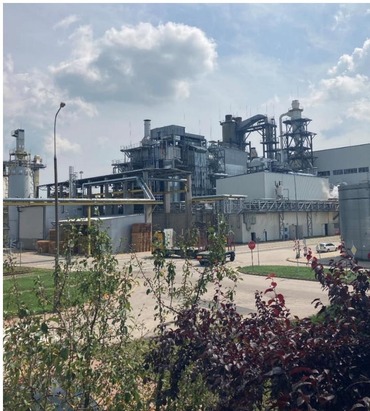
Fig. 1 A view of Woodeco MDF sp. z o. o. production plant located in Grajewo (Poland).