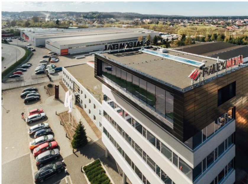
Figure 1 A view of Balex Metal production plant located in Bolszewo (Poland).