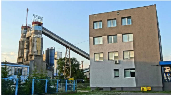
Figure 1. Street view of DBB Białe Błota Sp. z o.o. Sp. k.

DBB Białe Błota Sp. z o.o. Sp. k. was established as a response to the demand of the construction services market for structural elements of buildings such as beams, columns, girders and slabs. The company's goal is to produce prefabricated concrete products of the highest quality, including prestressed ones. The company plant located in Białe Błota (Poland) produces prefabricated concrete elements - structural elements of buildings such as beams, columns, girders and slabs. Its goal is to produce prefabricated concrete products of the highest quality, including prestressed ones, which are sold to the Polish and European markets. Prefabricated concrete elements are used as structural elements of large-scale warehouse and industrial facilities constructed as general contractor by Depenbrock Polska.