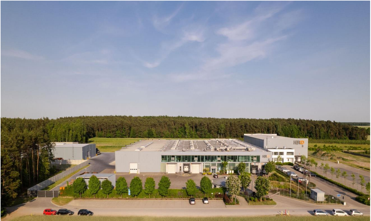
Figure 1 Bird's-eye view of Herco Sp. z o.o.

Herco Sp. z o.o. is one of the largest nail manufacturers in Europe with 30 years experiences. It specializes in high quality nails for hand and automatic nail guns which are used in wood construction, prefab housing and packaging industry. The factory of Herco is located in the center of Poland with very good access to European network of highways. Herco sales its products mainly for clients in European Union and North America.