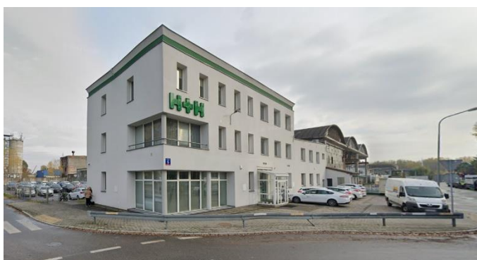
Fig. 1. The view from the street of H+H Polska Sp. z o. o. in Warsaw

H+H Polska Sp. z o. o. belongs to the H+H International A/S Group, a leading manufacturer of "white wall materials" in Europe, listed on the Copenhagen Stock Exchange. It has been operating on the Polish market since 2006. It produces and supplies a complete range of products made of autoclaved aerated concrete, and since 2018 also calcium silicate elements. The success of H+H Polska is the result of the joint work of nearly 600 people employed in 11 production plants. It is