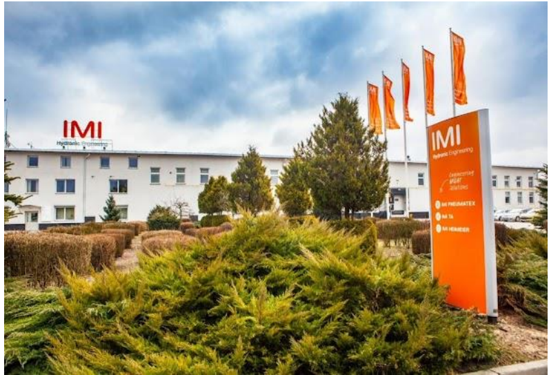
Figure 1 The view of IMI International Sp. z o.o. manufacturing plant located in Olkusz

As IMI Hydronic Engineering is a leading HVAC company with a valves montage plant located in Olkusz (Poland). Company is provider of technologies that deliver energy efficient water-based heating and cooling systems for the residential and commercial building sectors. Throughout the history, company have been at the forefront of HVAC industry innovation. The portfolio of brands has what is needed – a complete range of unique, industry-leading products and services. IMI Hydronic Engineering is a part of IMI PLC Group, listed on the London Stock Exchange on FTSE 100 list.