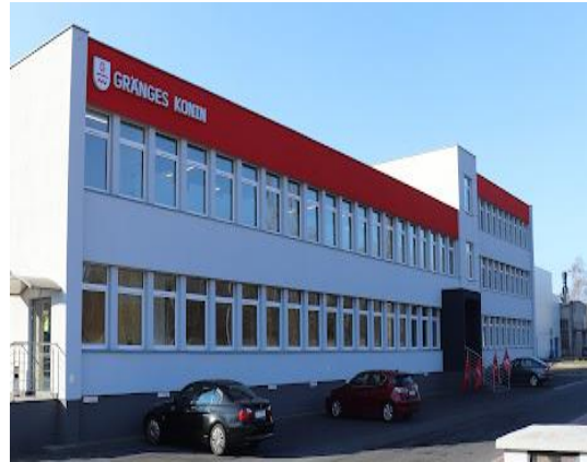
Fig. 1 The view of Gränges Konin S.A. plant in Konin

In 2020, the plant was taken over by Gränges AB and the Company's name was changed to Gränges Konin S.A. The annual production capacity of the plant in Konin is approximately 100 thousand tons of flat rolled products, and thanks to investments in both the foundry and rolling mill departments, the plant's annual production capacity in 2025 is to increase to 140 thousand tons of rolled products.