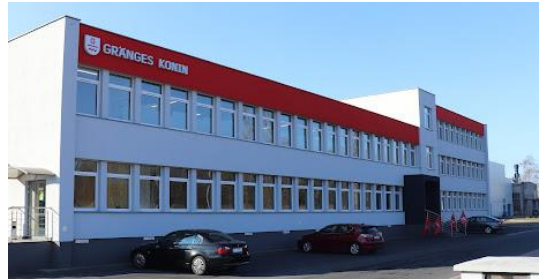
Fig. 1 The view of Gränges Konin S.A. plant in Konin

In 2020, the plant was taken over by Gränges AB and the Company's name was changed to Gränges Konin S.A. The annual production capacity of the plant in Konin is approximately 100 thousand tons of flat rolled products, and thanks to investments in both the foundry and rolling mill departments, the plant's annual production capacity in 2025 is to increase to 140 thousand tons of rolled products.