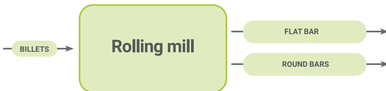
Fig. 1 Flow diagram

A mass allocation was applied to LCA calculations. The data required for the calculations were collected from the production departments of CMC Poland sp. z o.o., in the form of electronic or paper reports. The calculations were performed for a functional unit of 1 tonne of product. Inputs and outputs to the production process of flat and round bars were defined based on the production reports and information from the departments. The set of data was collected in a file called „input data” and used as input to the LCA calculations in the LCA for Experts software (Sphera). Electricity grid mix for Poland modeled by Sphera. The share of electricity from RES accounts for 30% of the total electricity demand. The RES energy has been modelled according to the energy guarantee certificates.