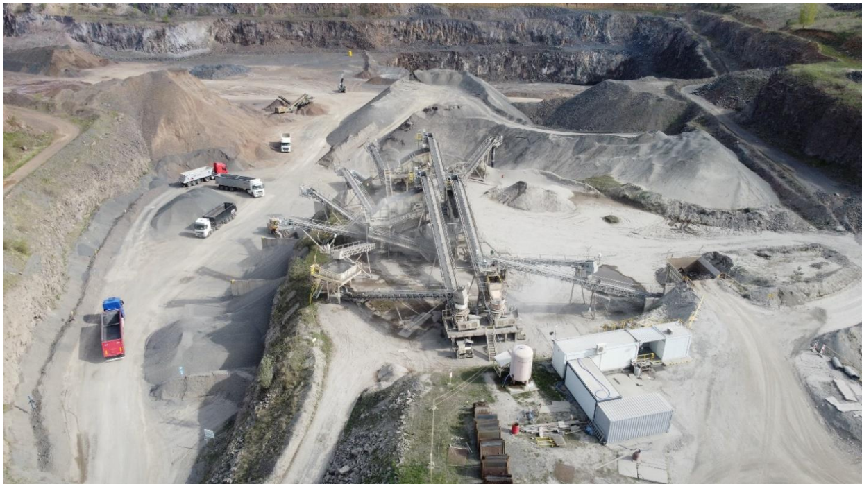
Figure 1. A view of The Targowica Plant, Trzuskawica S.A. in Targowica, Poland

Type III Environmental Product Declaration No. 706/2024