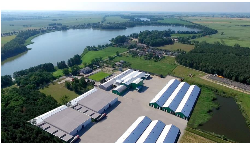
Figure 1 Fair Packaging production plant in Buszewo, Poland

Fair Packaging Sp. z o. o. Sp. k. has been producing and processing products made of foamed polyethylene for over 20 years. The beginnings of the company's activity were mainly the production of simple industrial packaging. Today, thanks to intensive R&D work, Fair Packaging supplies leading brands from the automotive, electronics, household appliances, furniture and construction industries.