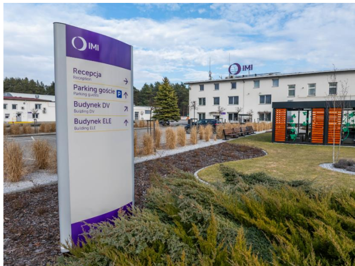
Figure 1 The view of IMI International Sp. z o.o. manufacturing plant located in Olkusz

Climate Control is leading HVAC solutions provider, with manufacturing sites located across the globe. Company is provider of technologies that deliver energy efficient water-based heating and cooling systems for the residential and commercial building sectors. Throughout the history, company have been at the forefront of HVAC industry innovation. The portfolio of brands has what is needed – a complete range of unique, industry-leading products and services. IMI Climate Control is a part of IMI PLC Group, listed on the London Stock Exchange on FTSE 100 list.