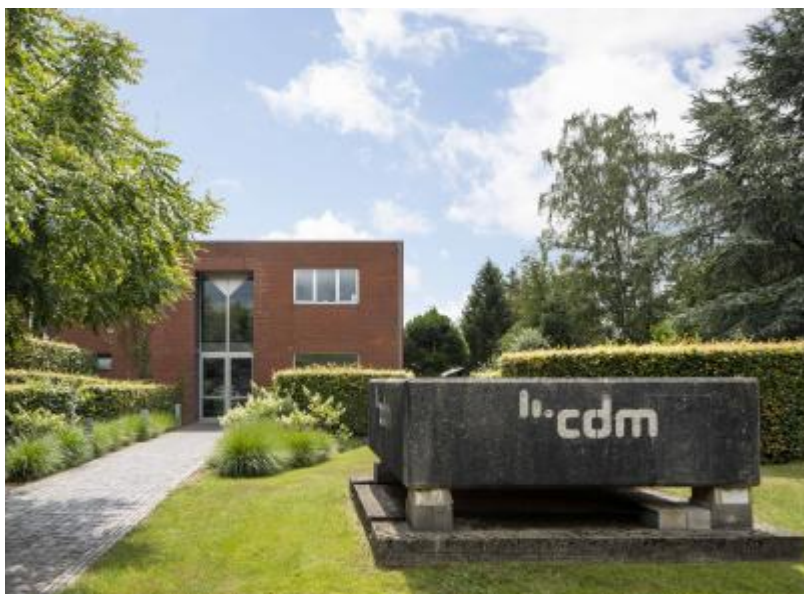
Figure 1. A View of CDM Stravitec headquarter located in Overijse (Belgium)

CDM Stravitec is an international engineering and manufacturing company headquartered in Overijse (Belgium), specializing in the design, production, and supply of vibration and noise isolation systems for the building and construction sector. For more than seven decades, the company has been developing solutions that improve acoustic comfort and vibration control in a wide range of applications, including recording studios, concert halls, residential and office buildings, sports facilities, and transport infrastructure. CDM Stravitec