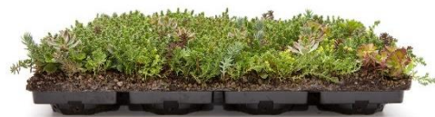
Fig 2. A view of Standard 60/25 module

Nature Impact Green Roof Standard consists of recycled plastic trays, substrate and plants – at least 12-15 species of sedum, approx. 4 of them are naturally occurring species in Danish vegetation. Coverage minimum 90%. Can be applied to roofs with a slope of 0 to 25 degrees (above 14 degrees support profiles should be installed).