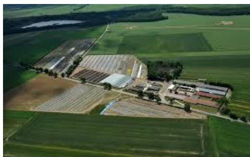
Fig 1. A view of Kompozycje Ozdobne the nursery for Nature Impact - Karwice Sp z o.o. in Karwice (Poland).

Nature Impact A/S is a Danish company that produces and delivers concept-based systems solution within green roofs and plant walls. Nature Impact was founded by the Larsen family in 2013. The family has been in the gardening and horticulture industry for 5 generations. Nature Impact A/S's nursery, Kompozycje Ozdobne - Karwice Sp z o.o., is located in northern Poland.